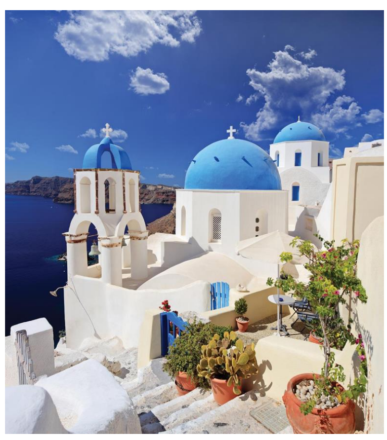
11 Days • 14 Meals: 9 Breakfasts, 1 Lunch, 4 Dinners

HIGHLIGHTS... Athens, Taverna Dinner Show, Acropolis, The Parthenon, Mykonos Old Town, Santorini Island, Oia Village, Ancient Akrotiri, Wine Tasting